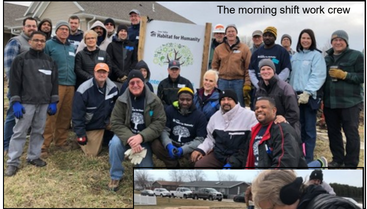
The morning shift work crew

To register as Interfaith volunteer builder, go to https://build.iowavalleyhabitat.org/charities/5390/volunteer