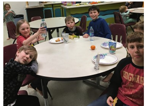
Dinner with friends is always fun!