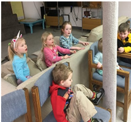
Enjoying a karaoke performance.

Want to enjoy an evening of "you" time while your children have some fun at church? Then be sure to register for Parents' Night Out to be held on Friday, April 19, from 5:00-7:30. Children ages infant to 10 years of age are welcome to join our adult volunteers for fun games, activities, and a light supper. You get to decide how you want to spend your time!