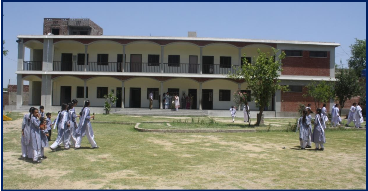
The classroom block is built in two stages and includes a well-equipped science room for post-secondary.