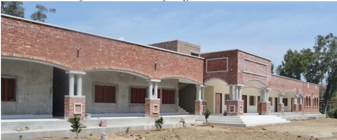
Another view of the Gill-Nicholson passed Pasrur Boys School.