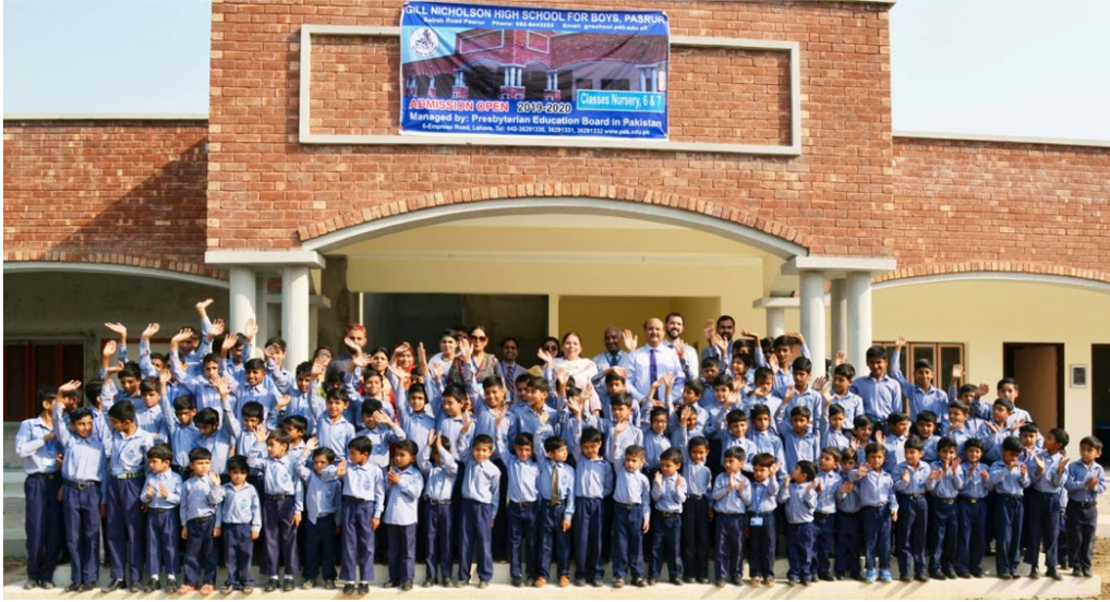
The dream of a Gill-Nicholson Boys High School in Pasrur is realized.