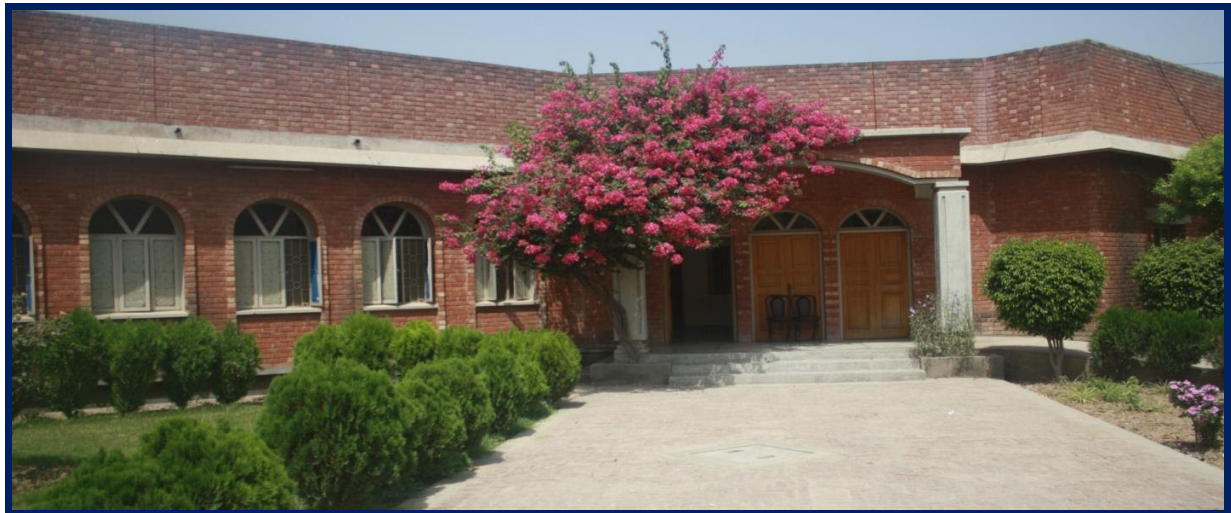
Pasrur boarding house for impoverished Christian girls is completed.