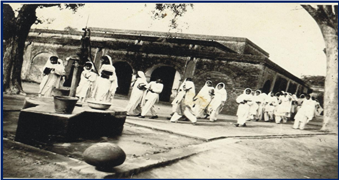
An early photo of the Pasrur Christian Girls School.