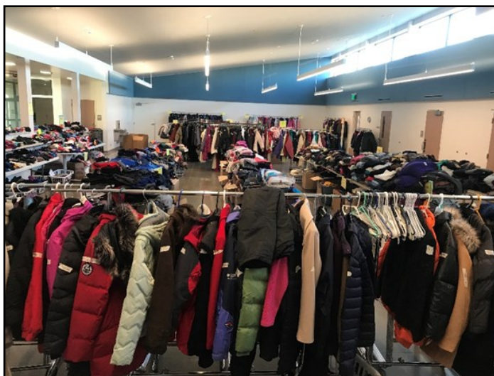
Clothing displayed at the 2020 distribution

Donations of new or gently used outerwear for children and adults are needed. Our highest priorities are: winter coats and jackets of all sizes: snow pants, hats, gloves, mittens, winter scarves, warm socks and winter boots. We will also gladly accept sweaters, sweatshirts and sweatpants. Please begin collecting these items and keep them at home until further notice. Also, please consider donating a box of large, strong lawn and leaf bags that can hold several coats for the shoppers.