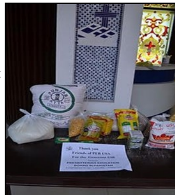
Food items sent to the girls

energy and creativity that will serve her well in addressing the needs of the