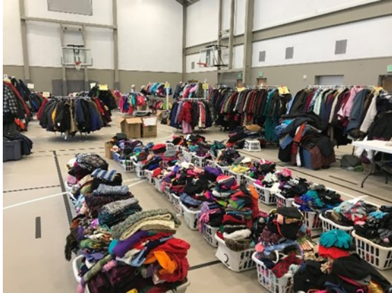
Order, after two days of setup & sorting.

An amazing 1,400 patrons were served at the distribution from 9 a.m. to 3 p.m. on the 26.