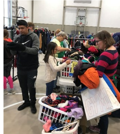
Escorts assist patrons in making selections.

Because the distribution site is not easily accessible by public transportation, the CRC contracted with Iowa Central School Bus to run a shuttle from the Kingdom Center in Iowa City and the Coralville Recreation Center. Serving only 47 patrons, the shuttle was not well utilized.