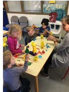
Everyone loves Play-Doh!